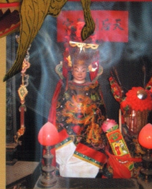
農曆三月廿三 漁民風俗 天后誕 23rd of the Third Lunar month Birthday of Tin Hau