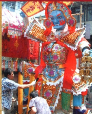
農曆七月十四 目蓮救母 孟蘭節 14th of the Seventh Lunar month Hungry Ghost Festival