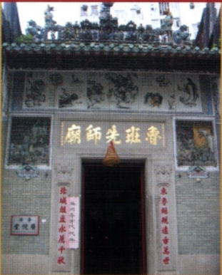
農曆六月十三 百藝之師 魯班誕 13th of the Sixth Lunar month Birthday of Lu Ban