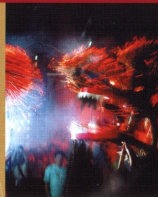
農曆八月十四至十六 舞火龍 中秋節 14th-16th of the Eighth Lunar month Tai Hang Fire Dragon Mid-Autumn Festival