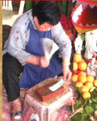
農曆驚蟄 祭白虎 打小人 5th/6th March Da Siu Yan (Beating the petty person)