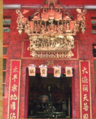
農曆正月廿六 孝子修建洛陽橋 觀音借庫 26th of the First Lunar month Loan from the Goddess of Mercy