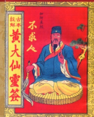
農曆八月廿三 難民神祇 黃大仙 23rd of the Eighth Lunar month Wong Tai Sin