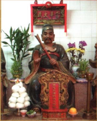
農曆正月十五前 六十甲子神 攝太歲 Before 15th of the First Lunar month Xie Tai Sui (Elevate the yearly god of Tai Sui with Joss papers)

A lot of authentic objects for rituals like qi lin, fa pau and the fire dragon as well as some precious pictures will be shown.