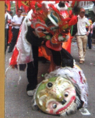
農曆四月初八 獅王爭霸 譚公誕 8th of the Fourth Lunar month Birthday of Tam Kung