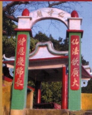
農曆七月初七 牛郎織女 七姐誕 7th of the Seventh Lunar month Seven Sisters Festival